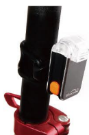
QUICK TO MOUNT AND RELEASE