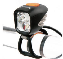
RUNTIME 3.2 HOURS @ 100% BRIGHTNESS