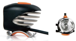
FRONT LIGHT AND TAIL LIGHT COMBO