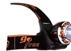
ALUMINUM ALLOY BODY WITH PLASTIC SHELL