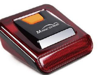
15 ULTRA-BRIGHT LEDs