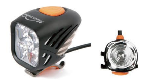
FRONT LIGHT AND TAIL LIGHT COMBO