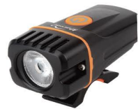
ALUMINUM ALLOY & PLASTIC