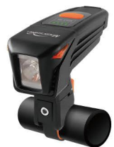
ONE ULTRA BRIGHT LED