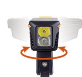
360° ROTATABLE MOUNT