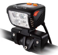
FOUR ULTRA BRIGHT LEDs