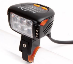
SIX ULTRA BRIGHT LEDs