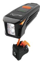
PATENTED QUICK RELEASE MOUNT