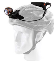
TOP CLICK SWITCH & HELMET COMPATIBLE