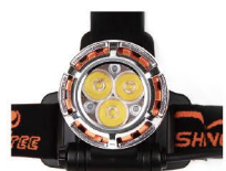
3 x SSC Z5 LEDs