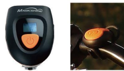
TOP CLICK SWITCH AND WIRELESS REMOTE SWITCH