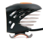
ALUMINUM ALLOY AND PLASTIC