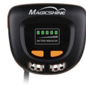
LED POWER INDICATOR