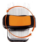
360° ROTATABLE MOUNT