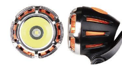
ONE CREE XP-G2 ULTRA BRIGHT LED