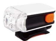
SIDE BUTTON, EASY OPERATION