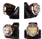
ALUMINUM ALLOY BODY WITH PLASTIC SHELL