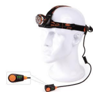
TOP CLICK SWITCH & REMOTE SWITCH