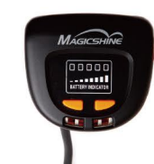
TWO TOP CLICK SWITCH