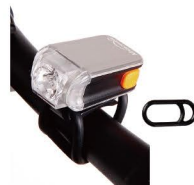
FIRM AND SECURE