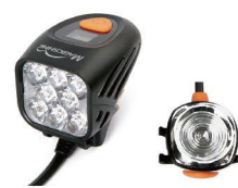
FRONT LIGHT AND TAIL LIGHT COMBO