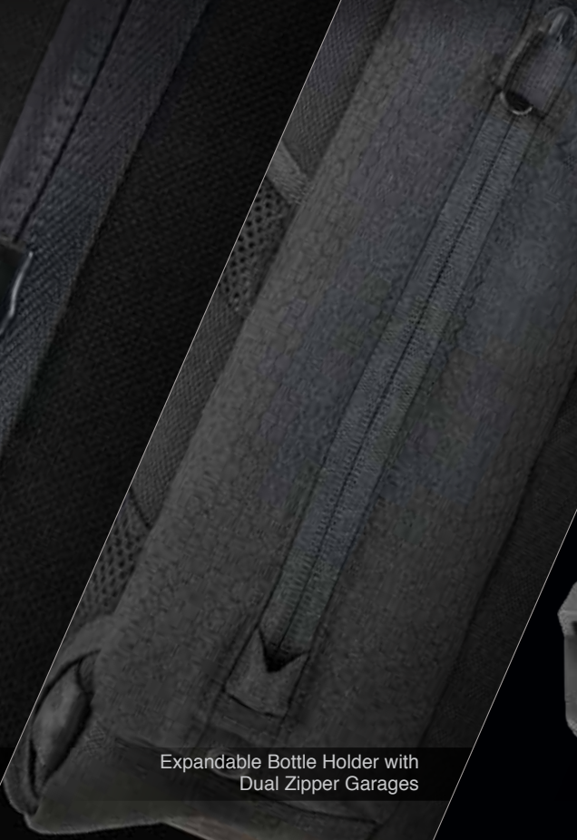
Expandable Bottle Holder with Dual Zipper Garages