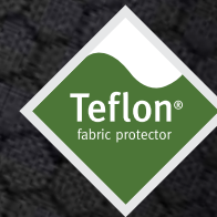
Dual Nylon Fabric Construction 500D Hex Ripstop / 1000D Plainweave