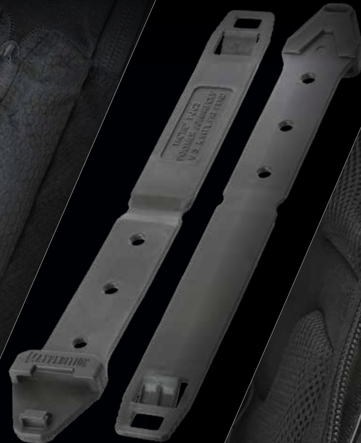
TacTie® Polymer Joining Clips U.S. and Int'l Patents Pending