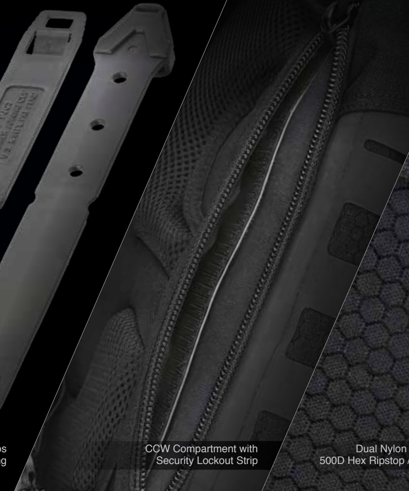
CCW Compartment with Security Lockout Strip