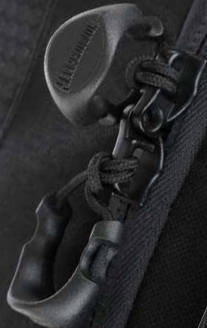
YKK® Zippers with Positive Grip Pulls