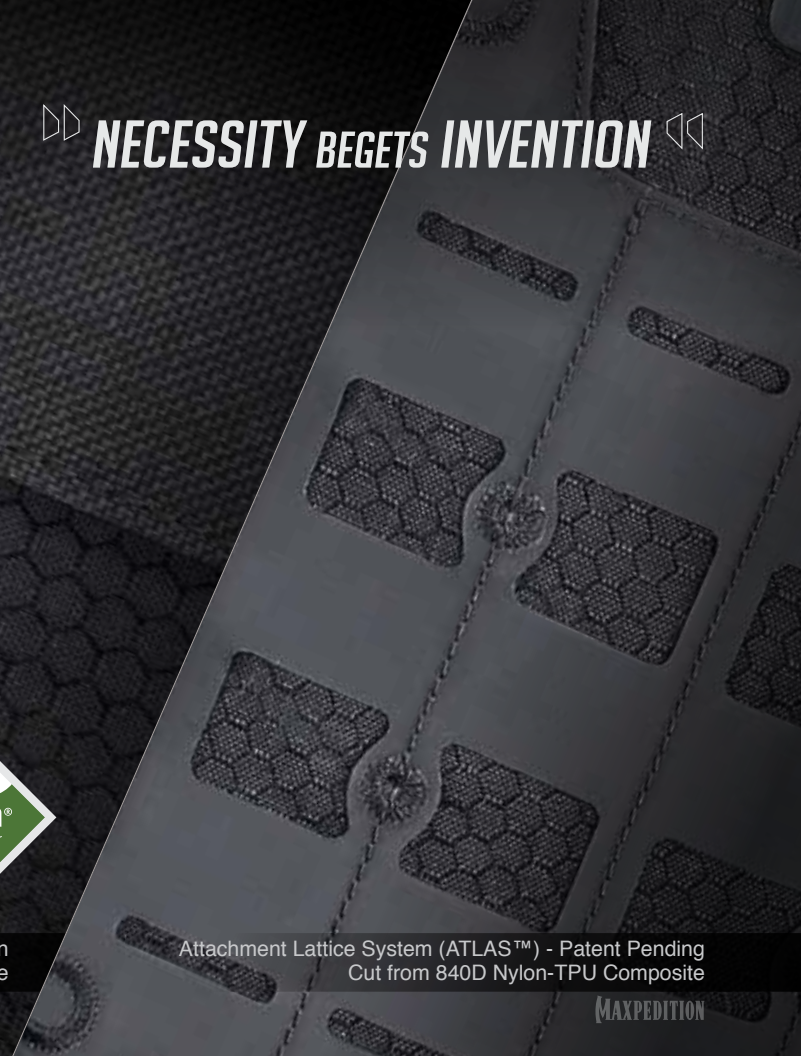
Attachment Lattice System (ATLAS™) - Patent Pending Cut from 840D Nylon-TPU Composite